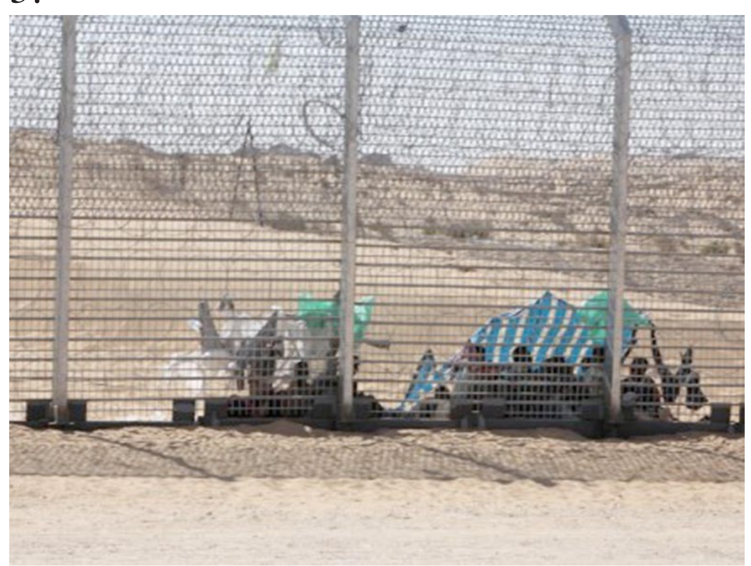
The 21 asylum seekers, detained at the border

Eritrea's human rights record is one of the world's worst. Several human rights violations are committed by the government or on behalf of the government. Freedom of speech, press, assembly, and association are limited. Those that practice "unregistered" religions, or escape military duty which is obligatory between the ages of 16 to 55, are arrested and put into prison. Well known prisoners are usually held in underground cells and less known prisoners are usually put together in cargo containers or in very overcrowded prisons that are sometimes located underground, and suffer from extreme heat (during the day) and cold (during the night) conditions. In addition to the harsh imprisoning conditions, torture, murder, and vengeance against the prisoners' families are common treatments imposed by the state.